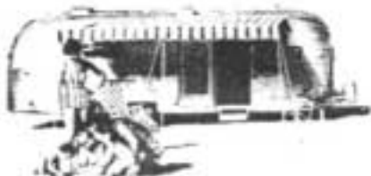
Airstream—since 1912 the world's set lightweight travel trailers

Here is a special version of the popular standard Flying Cloud—specifically designed for a travel twosome. Naturally this allows greater flexibility in interior arrangement, plus the addition of many unique features. You must see this unusual model to appreciate it. You'll be amazed by the feeling of roominess... and actually, many things are larger—a spacious living room; larger bathroom with separate shower, toilet and wash basin; much larger storage area. Nothing has been spared to bring you greater comfort and convenience than ever before in a 22 ft. model. Remember, too, that every other exclusive Airstream feature of the Flying Cloud is also included in this sleep-two model—comfortable beds; double sink and lots of formica for easy-to-clean convenience; oven and broiler stove; combination ice-electric refrigerator. Be sure to see and test-ride a Flying Cloud sleep-two for enjoyable trailering. Just hitch it to your car and you're ready to go at a moment's notice wherever your heart desires.